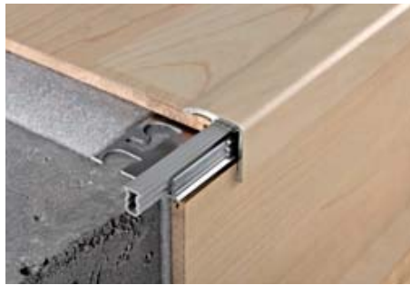
ALU. TOP + PIN INSERT + ALU. BASE 40 PUNCHED/PERFORED (6 anod. al. finishes of which 3 on demand) - bar length 2,7 LM - pack. 20 Pcs - 54 LM