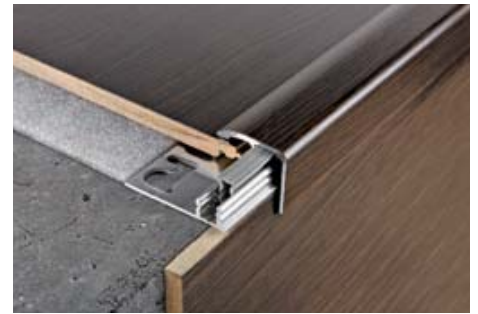
ALU. TOP + PIN INSERT + ALU. BASE 40 PUNCHED/PERFORED (27 wood finishes) - bar length 2,7 LM - pack. 20 Pcs - 54 LM