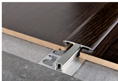
ALU. TOP + PIN INSERT + ALU. BASE 45 PUNCHED/PERFORED (6 anod. al. finishes of which 3 on demand) - bar length 2,7 LM - pack. 20Pcs - 54 LM