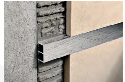
ANODIZED ALUMINIUM thermo packed bar length 2,7 lm - pack. 40 Pcs - 108 lm