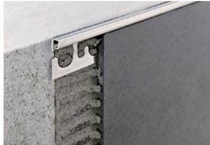
SUPER POLISHED STAINLESS STEEL AISI 304/1.4301-V2A thermo packed - bar length 2,7 lm - pack. 40 Pcs 108 lm - 8/10mm

SUITABLE FOR USE IN CONTACT WITH FOODSTUFFS.