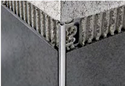
POLISHED STAINLESS STEEL AISI 304/1.4301 V2A with protective film bar length 2,7 lm - pack. 40 Pcs - 108 lm - 8/10mm

POLISHED, SUPER POLISHED AND SATIN FINISH STAINLESS STEEL AISI 304/1.4301-V2A