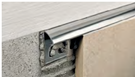
POLISHED STAINLESS STEEL AISI 304/1.4301-V2A with protective film bar length 2,7 lm - pack. 20 Pcs - 54 lm - 10/10 mm

PROJOLLY is a rounded bead profile in polished, super polished, sanded and satin finish stainless steel AISI 304/1.4301-V2A that can be applied on external corners of coverings. It can be used to close the perimeter of coverings and like a connection profile between step tread and riser of stairs coated with ceramic or natural stone tiles. Its particular section, the availability in three different finishes and special pieces such as internal and external corners, end caps and joints make PROJOLLY a much sought-after profile that allows a workmanlike application even in environments subject to high mechanical stresses.