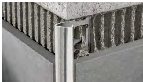
SATIN FINISH STAINLESS ST. AISI 304/1.4301-V2A with protective film bar length 2,7 lm - pack. 20 Pcs - 54 lm - 10/10 mm