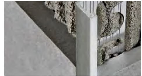
BRUSHED ALUMINIUM (silver, titanium, black, copper, antique bronze) thermo packed - bar length 2,7 lm - pack. 40 Pcs - 108 lm