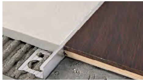
POLISHED ALUMINIUM (chrome, gold, copper, titanium, black) thermo packed - bar length 2,7 lm - pack. 40 Pcs - 108 lm

1. Choose "PROTERMINAL" according to the tile thickness and desired finish (color). 2. Cut "PROTERMINAL" to the desired length and apply the adhesive on the support where the profile will be laid. 3. Press the anchoring flange of "PROTERMINAL" into the adhesive. 4. Lay the tiles, aligning them with the profile leaving a 2 mm joint. Remove immediately all remains of adhesive from the surface of the profile. 5. Fill the joints between the profile and the tiles with grout, in order to avoid water stagnation. Remove immediately all the remains of grout from the surface of the profile.