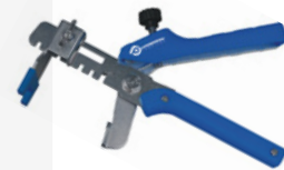
TRACTION PLIER for PROLEVELING WEDGE SYSTEM