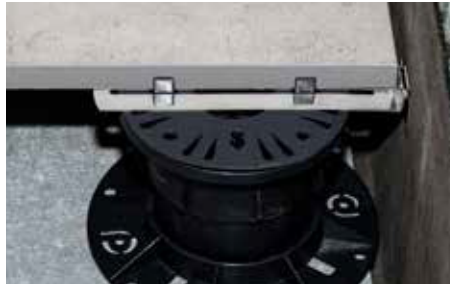
PERIMETER SPACER PROSUPPORT SYSTEM Stainless steel AISI 316L / 1.4404 - V4A pack 40 Pcs