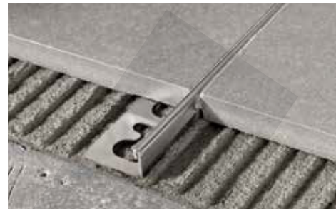
POLISHED S TAINLESS S T. AISI 304/1.4301-V2A with protective film bar length 2,7 lm - pack. 40 Pcs - 108 lm - 10/10 mm (H 15 to H 30 mm - pack. 20 Pcs - 54 lm)