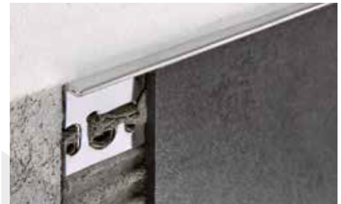
SATIN FINISH S TAINLESS S T. AISI 304/1.4301-V2 A with protective film bar length 2,7 lm - pack. 40 Pcs - 108 lm - 10/10 mm (H 15 to H 30 mm - pack. 20 Pcs - 54 lm)